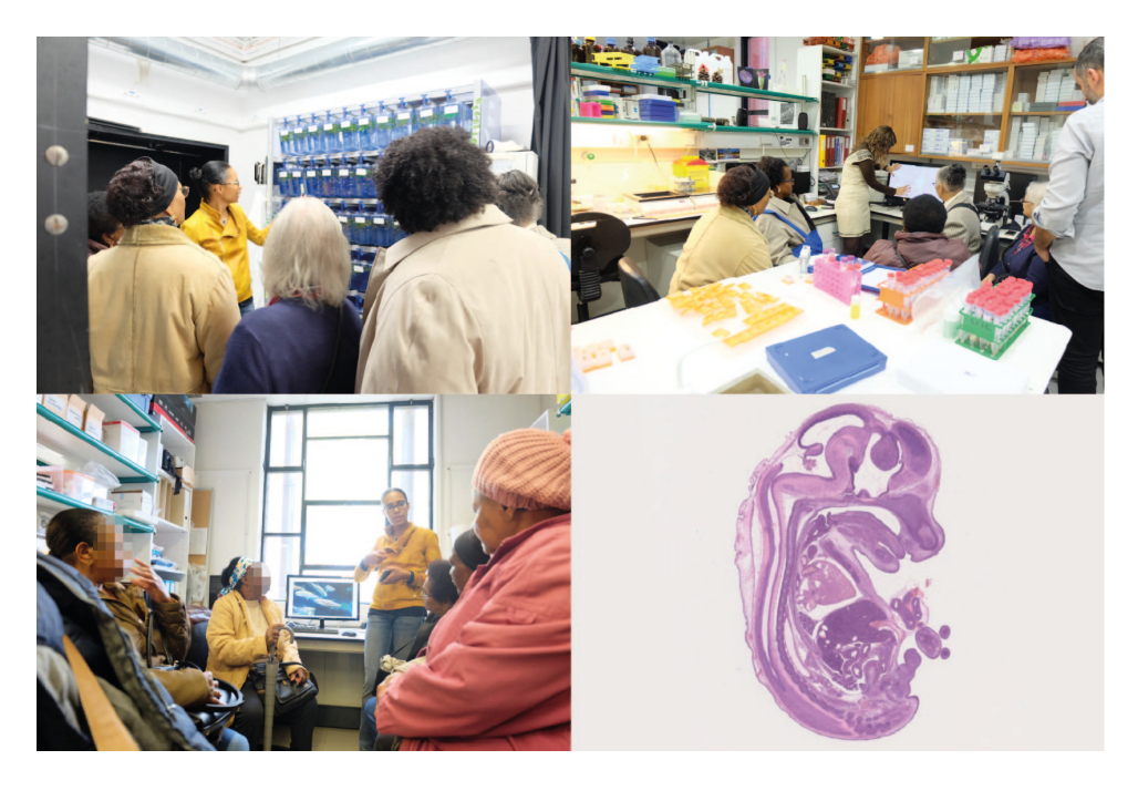
Figure 4 . Photographs at IGC, and an image from an embryo section from the Histopathology Unit.