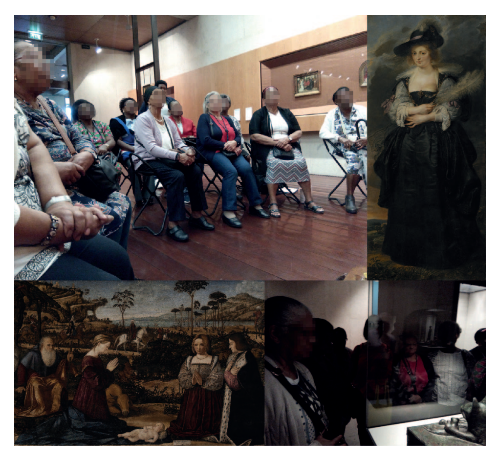
Figure 3 . Photographs at the museum, and images from the two favourite paintings in the museum collection. Top right: portrait of Helene Fourment, by Peter Paul Rubens, ca. 1630–32; bottom left: Holy Family and Donors by Vittore Carpaccio, 1505; © Calouste Gulbenkian Foundation.