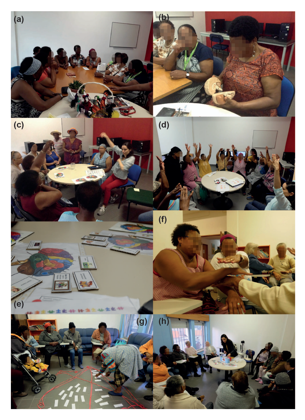
Figure 2. Photographs of in-house sessions. (a) Session 1 with memory objects; (b) Session 1 with the brain model; (c) Session 2, mimic of dressing; (d) Session 3, movement representing brain growth; (e) Session 3, game of brain regions and functions; (f) Session 4, arm dance coordination activity; (g) Session 6, collection of words during the poetry activity; (h) Session 8, project narrative.

Then, the project's public presentation was prepared by the community, BS, and social worker. It took place at a concert hall nearby and consisted of a sequence of individual statements about the project, created and recited by participants and the BS, while a network of fabric yarn was created on stage. The placement on stage, wardrobe, sequence and props were discussed, prepared and rehearsed by the community and the BS. A small exhibition of memory objects was put on display.