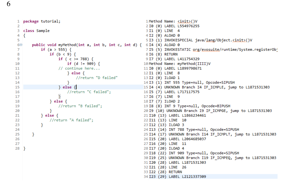
Fig. 2: A simple Java class. Source code is on the left and bytecode is on the right.