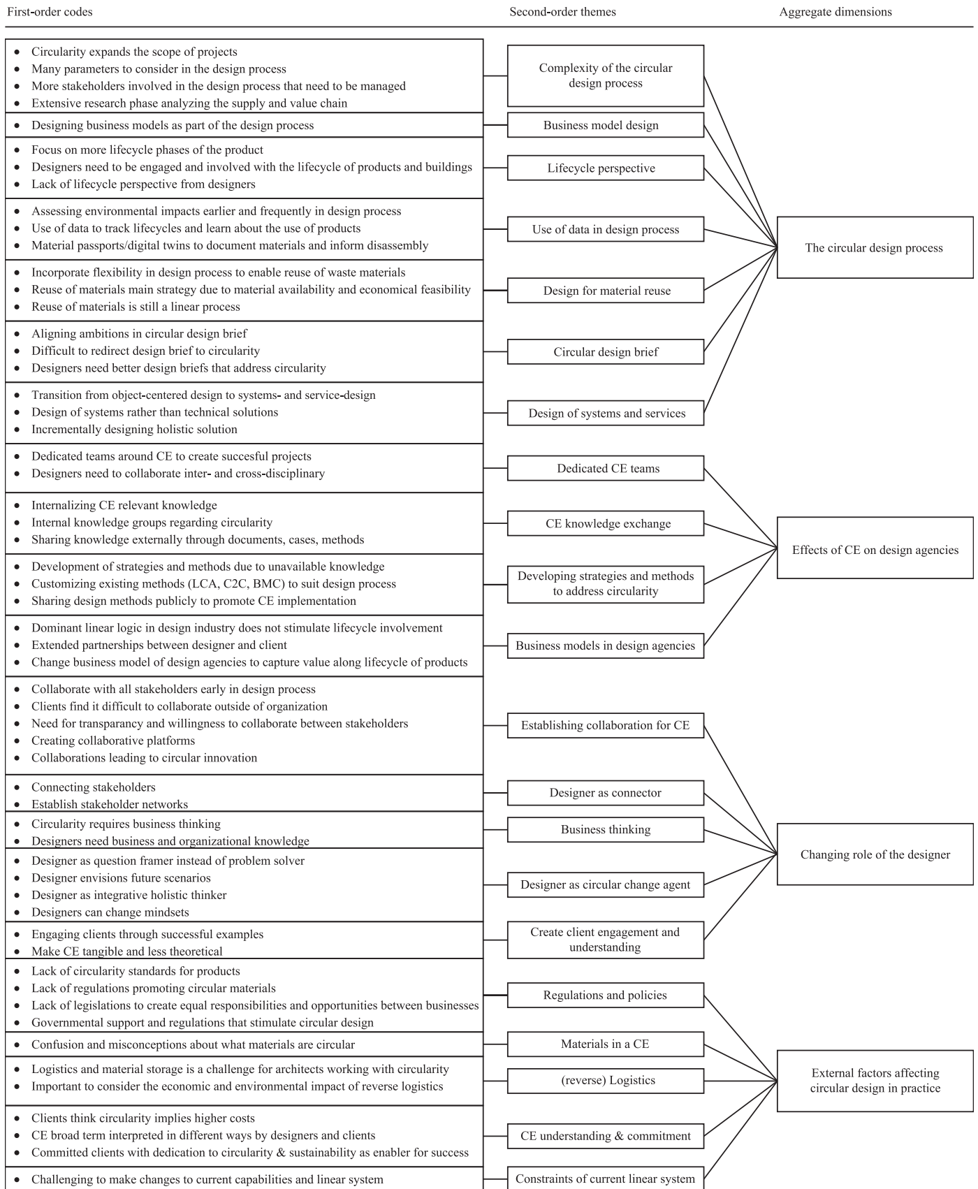
Fig. 1. Overview of the coding scheme.