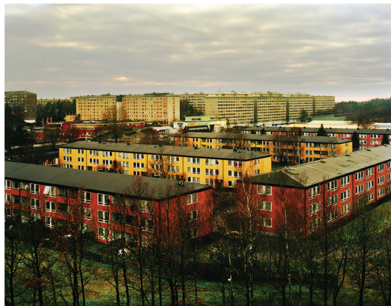
Figure 1. Hammarkullen was built during in the period 1968–1970 and is among the one million homes constructed during the 1960s and 1970s in Sweden (The Million Programme). The photo shows the buildings containing the 890 apartments discussed in the present article and owned by the public housing company Bostadsbolaget. In total there are 8,200 inhabitants in Hammarkullen, living in 2,200 rental apartments all owned by the same public company, as well as in 600 private row houses and villas.

Learning Lab Hammarkullen was a transdisciplinary research project (Carew & Wickson, 2010; Posch & Scholz, 2006) carried out 2014–2019 and led by the Department of Architecture & Civil Engineering at Chalmers University of Technology. The Union of Tenants was the driving actor in