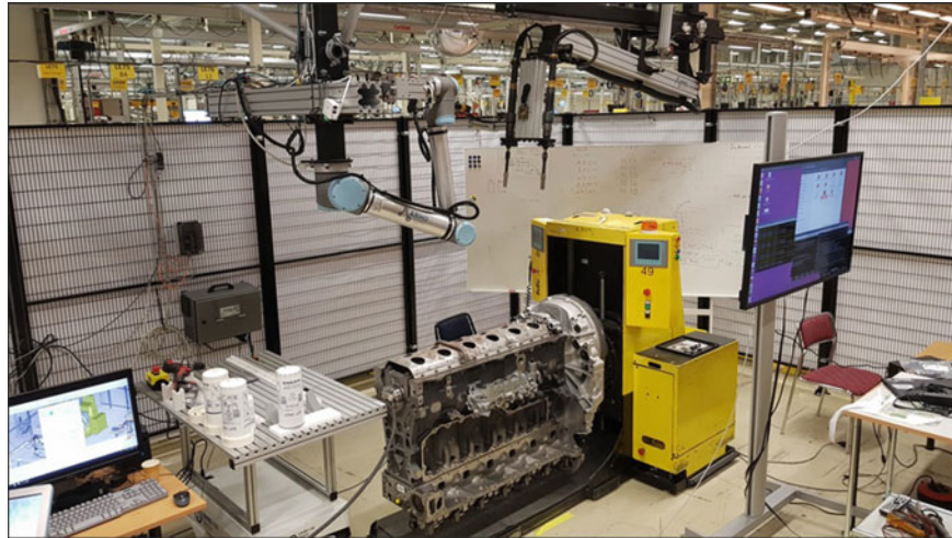
Fig. 2 Collaborative robot assembly station controlled by a network of ROS2 nodes. A video clip from the demonstrator: https://youtu.be/TK1Mb38xiQ8

In the station, a robot and an operator work together to mount parts on the engine by using different tools suspended from the ceiling. A dedicated camera system keeps track of operators, ensuring safe coexistence with machines. The camera system can also be used for gesture recognition.