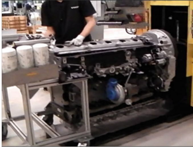
Fig. 1 The original manual assembly station