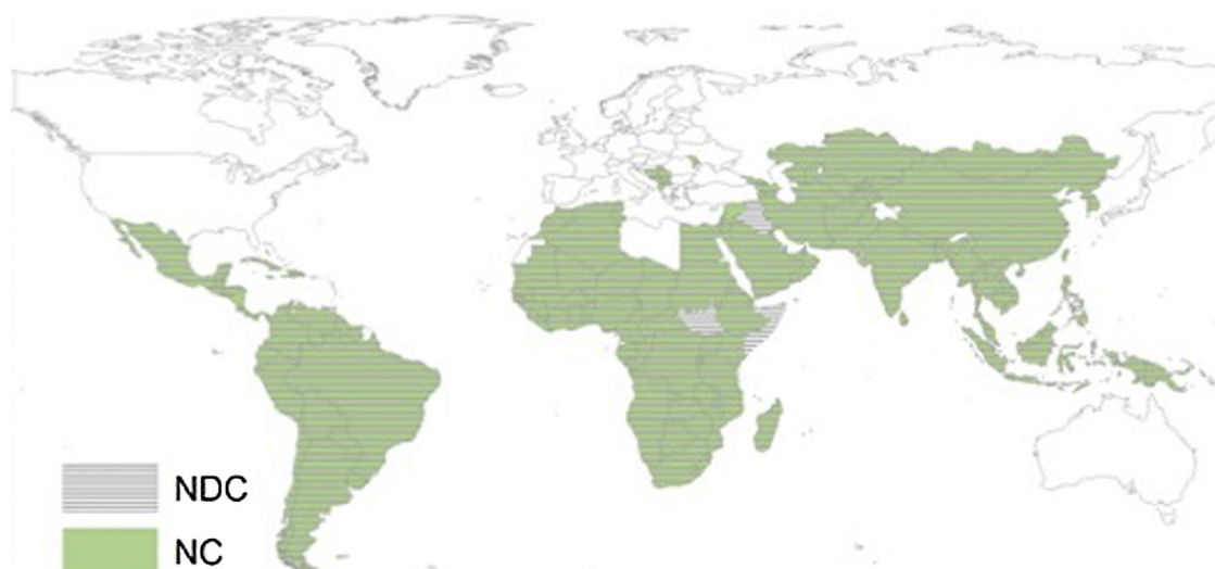
Fig. 1. Nationally Determined Contributions ( N = 147 ) and National Communications ( N = 148 ) reviewed.

above examined MRV capacities under REDD + processes. Agroforestry in REDD + MRV is also reported elsewhere (Rosenstock et al., 2018). Seven countries including Colombia, Costa Rica, Dominican Republic, Indonesia, Kenya, Rwanda and Uganda have proposed agroforestry-related NAMAs, but MRV systems are yet nascent or undocumented. The Clean Development Mechanism (CDM) and some voluntary market standards have created considerable experience of agroforestry MRV at the project scale (Lee et al., 2018). However, the links between project-scale interventions and MRV of national initiatives under the evolving UNFCCC MRV framework are not yet clear and thus are not considered here.