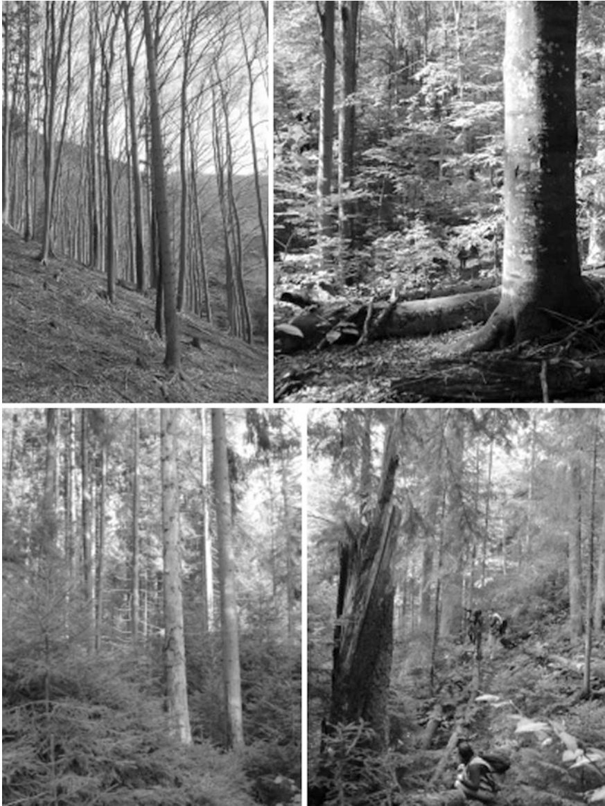
Fig. 2 Examples of forest stand structure in relation to age. Top left young, managed beech forest in the Austrian Alps. Top right old-growth beech forest in the Ukrainian Carpathians. Lower left mature Norway spruce plantation in the Ukrainian Carpathians, with some evidence of spruce decline. Lower right old-growth Norway spruce-silver fir forest in the Ukrainian Carpathians. Note the higher degree of structural complexity in the older forests, including vertically complex canopies, larger trees, and large woody debris both standing and downed.