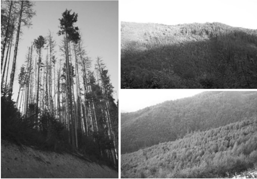
Fig. 3 Spruce decline and restoration in the Skole District of the Ukrainian Carpathians. Left declining Norway spruce stand with heavy mortality. Top right sanitation cut followed by replanting species endemic to the site. Lower right foreground shows a young, mixed species stand restored following sanitation cutting of declining spruce. This figure represents a forest restoration pathway, though there is evidence that sanitation cutting is being over-used as a way to circumvent regulations limiting clearcutting size.

1950s (Nijnik 2004), resulting in conversion of landscapes from old to young forest dominated. Some have argued that the current forest age distribution will result in future timber supply limitations if harvest levels are not increased during the near term (Nijnik and van Kooten 2000). In our view, however, this argument discounts the current deficit of harvestable stands (100–120 year old) relative to sub-merchantable stands. Rather, the solution is to allow the merchantable growing stock to build up both passively and through stand improvement treatments, such as intermediate thinnings. Others have drawn similar conclusions, arguing that “harvest potential will increase in the future” and pointing out that the area of mature stands almost doubled from the late 1980s to late 1990s (Polyakova and Sydor 2006). Whereas in the 1990s more than 80 % of gross annual increment was harvested each year, currently legal harvest rates are 50–60 % of annual forest growth in the Ukrainian Carpathians (Anfodillo et al. 2008), suggesting that timber stocks are increasing, not decreasing. Far from limiting future timber availability, the current distribution provides an abundant source from which merchantable timber will recruit over the next several decades.