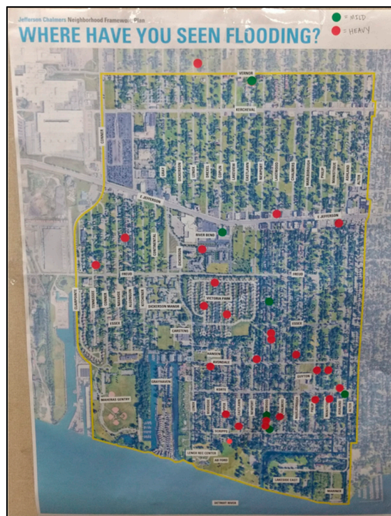
Figure 2. Flooding reported by residents in one of the study neighborhoods at a local meeting organized by the city government on March 27, 2018. Red dots indicate areas of heavy flooding seen, and green dots indicate mild flooding.