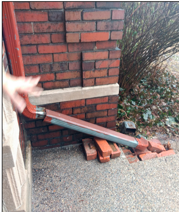
Figure 4. A resident showing her downspout disconnected from the city sewage system, in compliance with an ordinance which some residents felt created standing water and health issues.

People buying houses here are going to have to deal with all the problems with the foundations [of their homes] that are created from not having any drainage plan for a very long time . . . We've got ponds all over the place now because of this ordinance. What do we do? (7D)