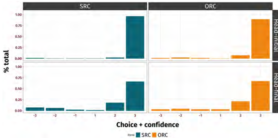
Figure 2: Breakdown of participants' responses by accuracy and confidence. Negative values on the x-axis indicate incorrect responses, while positive values indicate correct responses. High values (3) indicate high confidence in their response (irrespective of accuracy), while low values indicate low confidence in their response.