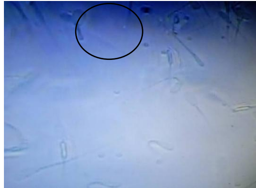
Picture 4: Microcephalic Spermatozoa