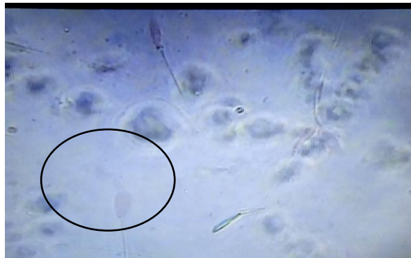
Picture 5: Tapend Head Spermatozoa

other treatments. However, treatment J0 (without addition of jamblang leaves extract), J1 (egg yolk-skim milk extender + 0.2 g/100 ml of jamblang