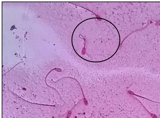
Picture 3: Coiled Tail Spermatozoa