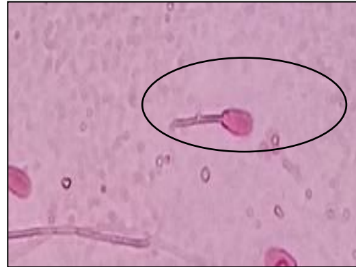
Picture 2: Short Tail Spermatozoa