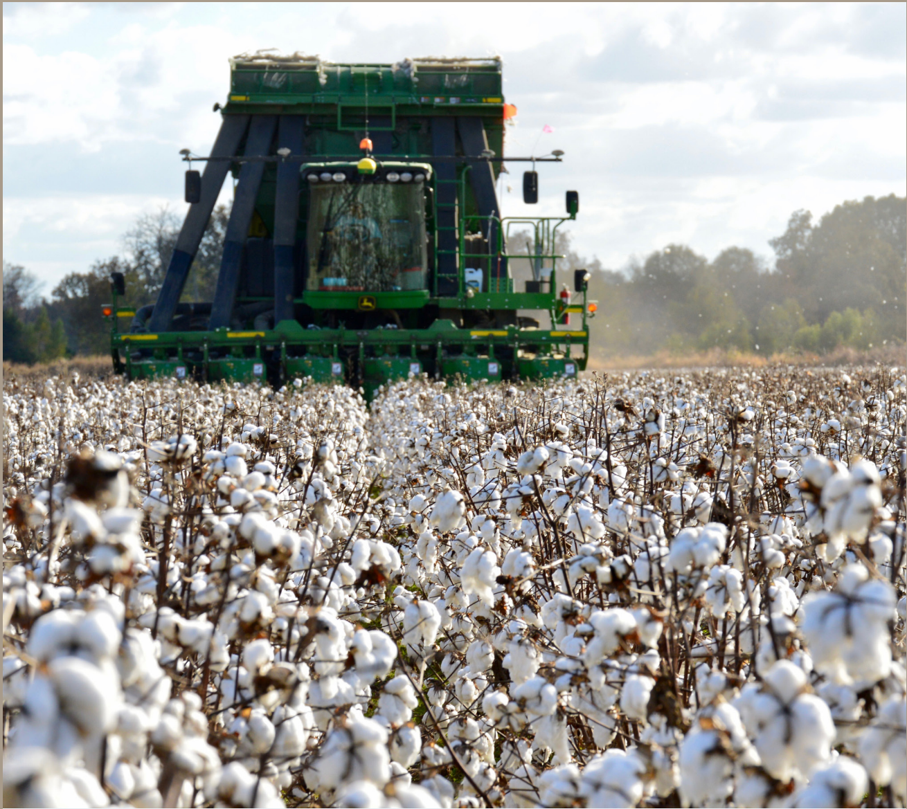
2020 Arkansas Large-Plot Cotton Variety Test in St. Francis County