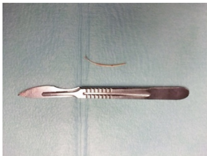
Fig. 4. Fish bone removed surgically.

Eikenella corrodens is a fastidious facultative anaerobic gram-negative bacillus that is part of the commensal microbiota of the mouth, upper respiratory tract, gastrointestinal and genitourinary mucosal surfaces. Eikenella infections are generally indolent in course and can mimic an anaerobic process due to the induction of foul-smelling suppuration [1, 17]. It needs incubation in an atmosphere rich in CO 2 for recovery in culture and has a predilection for causing endocarditis [1]. Eikenella grows slowly, normally taking 2 days or more to be recognized [1]. In fact, in our case, we could witness that the isolation and identification of this organism occurred after 5 days,