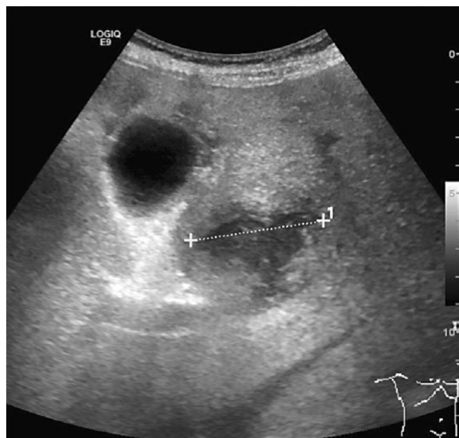
Fig. 1. Abdominal ultrasound: hepatic abscess, 4.5 cm in diameter, in segment IVb.

The authors present a case of liver abscess caused by Streptococcus anginosus and Eikenella corrodens secondary to a fish bone gastric perforation and penetrating trauma to the liver.