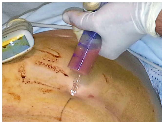
Fig. 3. Ultrasound-guided percutaneous drainage of the abscess.

S. anginosus sensitive to penicillin was isolated in two blood cultures and in the pus drained from the liver abscess. Moreover, E. corrodens was isolated also in one blood culture. An echocardiogram excluded infective endocarditis. The patient was treated for