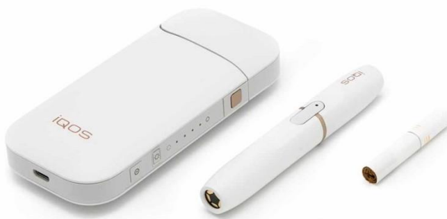
Figure 2. Picture and description of IQOS provided to respondents.

After providing a description of HTPs and a photo of IQOS (See Figure 2), the three dependent variables were assessed as follows: (1) awareness (i.e., “Have you heard about new electronic products that heat tobacco instead of burning it?” no = 0 and yes = 1); (2) those who indicated awareness were asked if they had seen HTPs for sale (“Have you ever seen any of these heat-not-burn products for sale in a store or online in Mexico?” no = 0 and yes = 1); (3) interest in trying HTPs (“Would you be interested in trying one of these heat-not-burn products if you had the opportunity?”) with response options dichotomized (i.e., “not at all” or “a little interested” = 0; “somewhat interested” and “very interested” = 1).