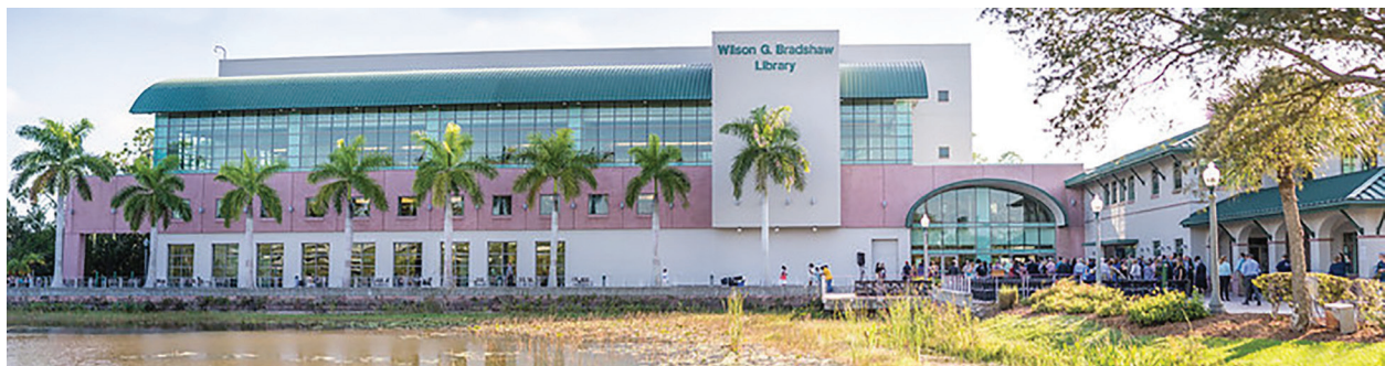
Figure 1. The Wilson G. Bradshaw Library, Florida Gulf Coast University.

How could the library help? Each year the provost has end-of-year funds to distribute among the