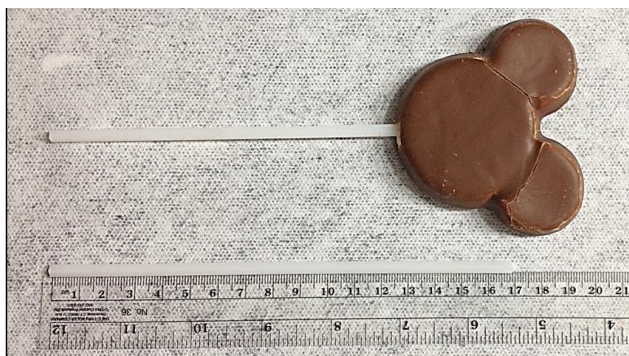
Figure 3: Type of candy whose stick was reportedly swallowed. ↗

Finally, we made a search in the literature and we surprisingly found that when there is gastric or duodenal perforation by a foreign object the clinical findings are similar to our case, for instance in the vast majority there was a slow course and latency period before presenting with the acute phase. A common finding besides gastric perforation was an inflammatory plastron or abscess, and was always treated with laparotomy and in some limited cases with minimal laparotomy plus abscess drainage and suture of the primary defect in the stomach and in two cases a patch of omentum was used (4, 5). In the case of our patient a subtotal gastrectomy of 50% with Roux-Y reconstruction was performed due to severe transmural inflammation, accompanied by multiple abscesses and a severe submucosal edema. The patient had a favorable outcome without any complications and has gained some of the lost weight. After