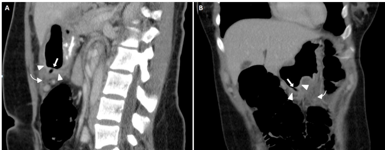
Figure 1: Enhanced CT of the superior abdomen in venous phase, which demonstrates in sagittal (A) and coronal planes (B) the tubular air filled foreign body (white arrow) penetrating the gastric wall (arrow heads), associated with peripheral fat stranding (curved arrow). ↑

chosis or psychiatric disease, alcohol abuse and being in prison. Objects that are frequently ingested are the teeth, toothbrushes and foreign bodies from the diet such as fish and chicken bones. The most commonly affected sites are the distal ileum, sigmoid colon or rectum (1, 2). Patients with perforation of the stomach, duodenum, or large intestine, usually ingest larger objects (2). The clinical presentation of gastric perforation by a foreign body tends to be hidden, with unspecific gastrointestinal symptoms such as chronic abdominal distension, decreased appetite, and epigastric mass sensation, usually with normal laboratory results (1, 3). The patient in this case had multiple visits to the doctor after the foreign body ingestion, and was treated for