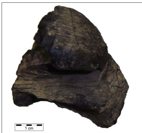
Figure 3. Handle of wooden container ( Betula sp.).

were identified in 2.9% of the fragments, and affected only Quercus sp. deciduous and Rosaceae/Maloideae . The presence of radial cracks (5.7%) and vitrification (1.9%) was sporadic, the former affecting Quercus sp. deciduous, Rosaceae/Maloideae and Ulmus sp., the latter affecting only Quercus sp. deciduous.