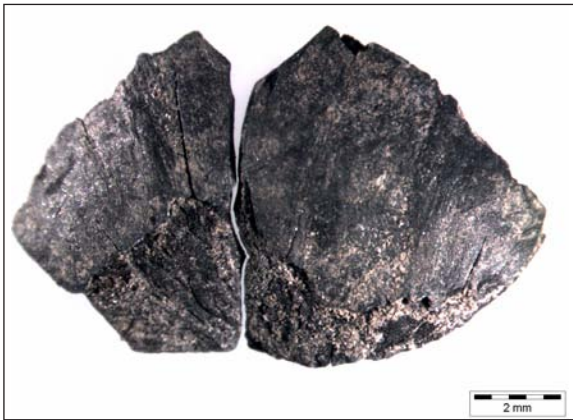
Figure 4. Fragmented pericarp base of hazelnut ( Corylus avellana ).

ronment, which determined the exploitation of forest resources in the past. This activity was conditioned by such issues as availability and proximity, but also by social and economic factors (settlement type, duration of occupation, group size, technological development, etc.). The occupation of caves was unusual during the Roman and medieval periods. The choice of these places for settlement could have been motivated by different factors: short-term occupations could reflect the use of the cave as a refuge during periods of instability, as a hermitage or, as in the case of Cova Eirós, as a fold for livestock. Diachronic occupation is evidenced at Cova Eirós, where the cave was used for cereal storage inside pits. In both cases the caves were probably occupied by small groups.