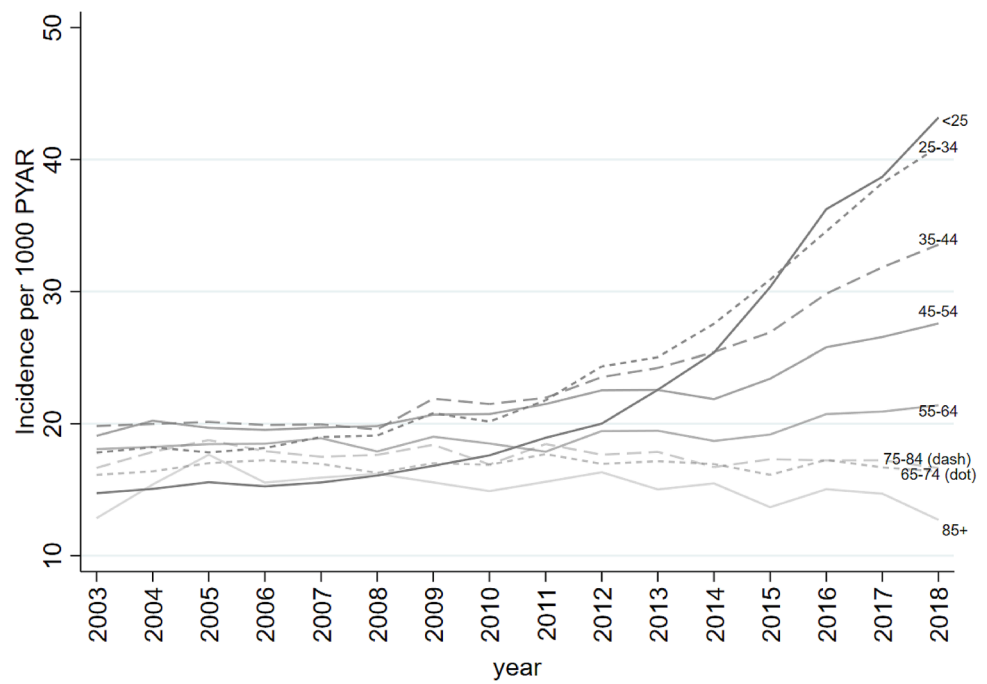
Fig. 2 Incidence of GP recorded anxiety (any anxiety code) per 1000 PYAR, by age

age groups, decreasing from 10.5/1000 PYAR to 8.1/1000 PYAR for those aged 75–84, and from 8.4/1000 PYAR to 6.1/1000 PYAR for those aged \geq 85 (Supplement 11).