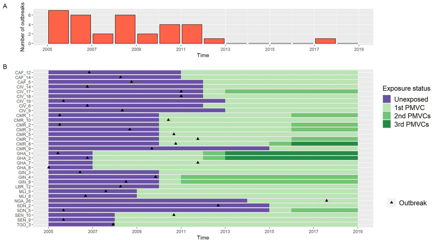
Fig 2. Swimmer plot of the chronology of exposure to preventive mass vaccination campaigns (PMVCs) and yellow fever outbreaks among the 33 African provinces both affected by an outbreak and targeted for a PMVC (2005–2018). (A) Time distribution of yellow fever outbreaks. (B) Swimmer plot. The 3-letter codes on the y-axis refer to International Organization for Standardization county codes (see S2 Table for complete province and country names).

https://doi.org/10.1371/journal.pmed.1003523.g001