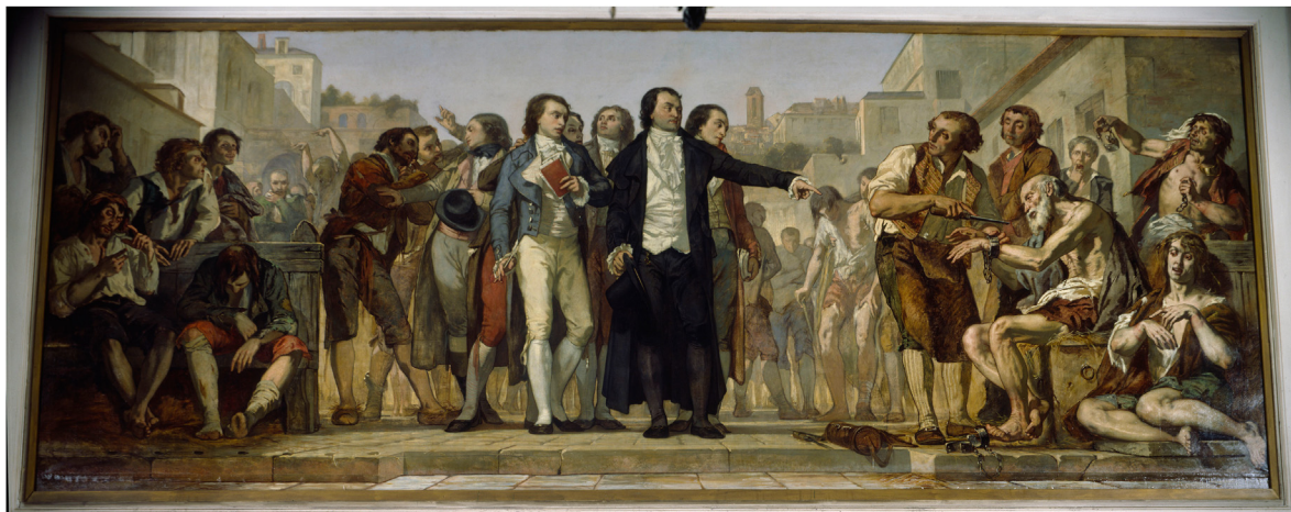
Fig. 2. Charles Louis Müller, Pinel faisant tomber les fers des aliénés de Bicêtre en 1792, 1849 . Oil on canvas, height: 5.2 m. Paris, Académie nationale de Médecine.

has made sure that this character is unmissable. She is the clearest link between the Salpêtrière in the eighteenth century and in the nineteenth, between the disordered space of the asylum and the rational teaching hospital.