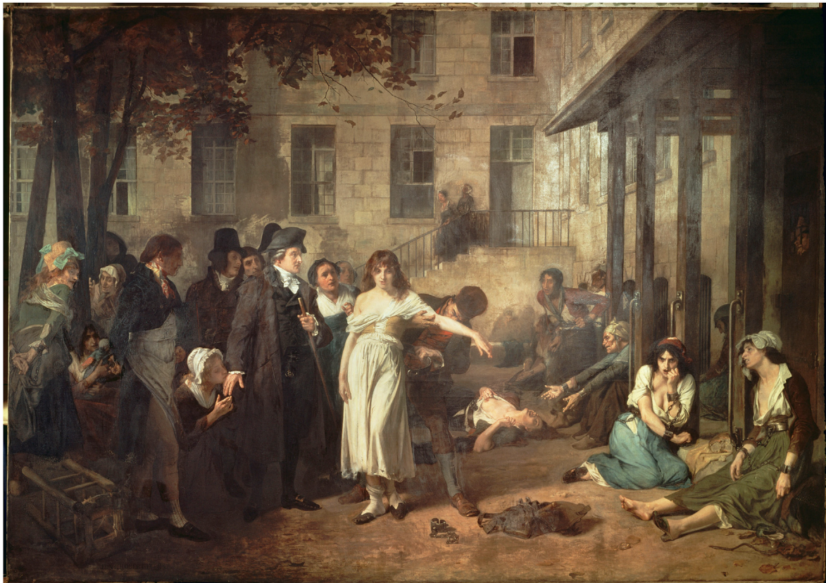
Fig. 1. Tony Robert-Fleury, Pinel Freeing the Insane from Their Chains , 1876. Oil on canvas, 13 feet 2 inches × 16 feet 5 inches. Paris, Hôpital de la Salpêtrière.

'liberation of the mentally ill from their chains' at Bicêtre and the founding of modern psychiatry in France (Pelletier & Davidson, 2015; Vandermeersch 1994; Weiner 2008). The importance and radiance of this humanistic act for (forensic) psychiatry can also be underlined by the fact that a depiction of Philippe Pinel can still be found today in many textbooks on psychiatry and on the cover of this very journal (Moller et al., 2015).