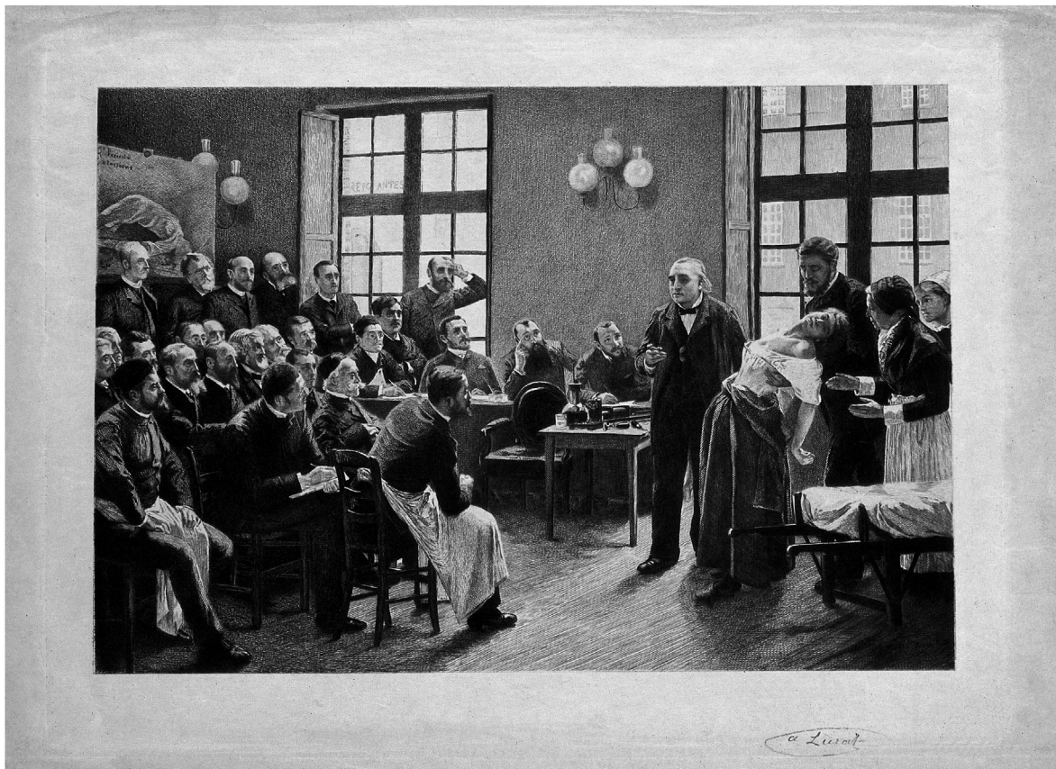
Fig. 4. Abel Lurat, Jean-Martin Charcot demonstrating hysteria in a hypnotised patient at the Salpêtrière, 1888, after André Brouillet, A Clinical Lesson at the Salpêtrière , 1887. Etching (state before lettering, apparently artist's proof), 24 × 34.8 cm. London, Wellcome Library.

Fleury's painting is nothing more than a silent memory of overcoming dark days. It is easy to overlook the fact that chaining up persons with mental disorders, quite literally, is still happening today, and not only in prison systems that are severely underfunded (Kurki & Morris, 2001; Patel & Bhui, 2018). For example, the last rings to chain inmates displaying 'a lack of self-control and endangering themselves or others' were removed in the Thorberg prison in Bern (Switzerland) only in 2016 after a public outcry over a then recent order of this measure to 'fixate' an inmate (Kaf/Miw, 2016). More figuratively speaking, it may be argued from the authors' point of view that Robert-Fleury's painting reminds the forensic psychiatric discipline, even 145 years after its creation, that the treatment of mentally ill people in appropriate facilities is still not a matter of course.