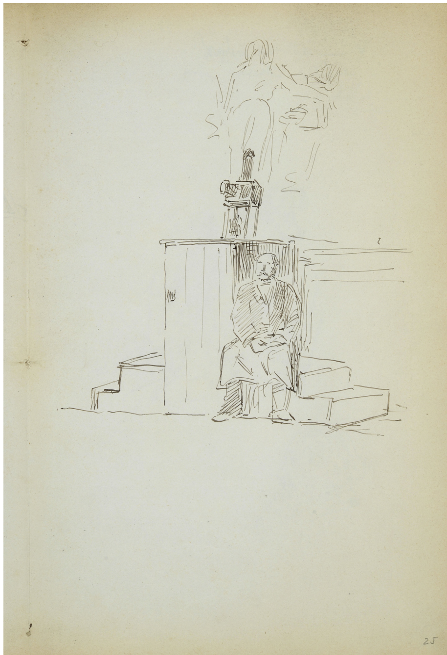
Fig. 3. Paul Richer, Cahiers d'observations cliniques pendant les leçons de Charcot à la Salpêtrière , 1882–1883. 31 × 20 cm. Inv. no. EBA 8142, Paris, École nationale supérieure des Beaux-Arts (ENSBA).

patient exhibiting the arched back typical of hysteria. While Brouillet's realist canvas attempts to show Charcot in a dispassionate clinical space, we are not far from Robert-Fleury's asylum courtyard filled with madwomen.