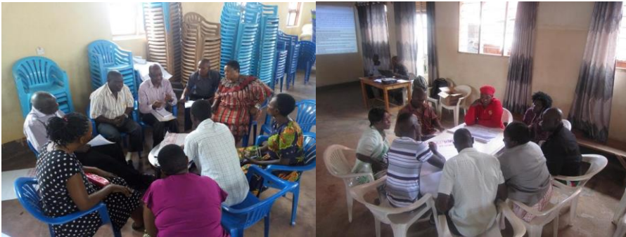
Figure 1. A group of participants Kawaala community during the back-casting exercise

http://t-group.science/2019/01/multiple-actions-have-been-developed-by-community-members-in-kampala-to-address-their-sustainability-problems/