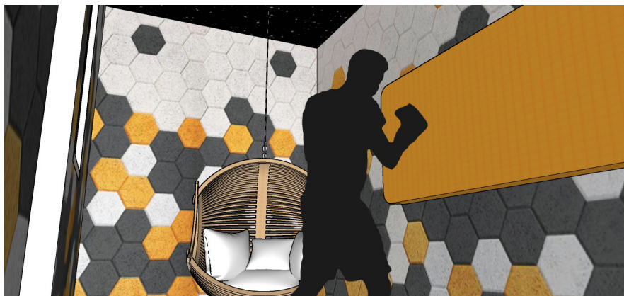
Figure 2 Re-regulation/de-escalation room (Image by authors)

Other common symptoms associated with CTE are irritability, impulsivity, and explosivity. According to the frustration-aggression hypothesis, when a desired act, such as not being able to lift a shade, becomes impeded, the person will start to feel frustrated. This frustration turns into aggression, such as pulling the shade out of the wall. Displacement often follows when a caregiver or loved one is spoken to as if the shade not rising was their fault. Hence, an analysis of probable triggers for irritability, impulsivity, and explosivity had to be considered throughout the design development stage. Additionally, a re-regulation/de-escalation room was added to the space as a way to constructively address undesirable emotions. The inclusion and subsequent beneficial uses of this room, however, requires sets of rules to be established and followed. Because of these added social layers, the inclusion of a re-regulation/de-escalation space must be carefully considered.