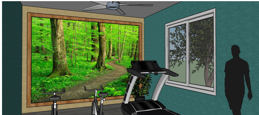
Figure 3 Exercise room

The exercise room accomplishes two things. The first is access through a variety of nature scenes and based on the attention restoration theory might help with the person's concentration levels. To help bolster the experiential qualities, the wall and screen are concave to include the scene in the person's peripheral sight. While this is an example, other design features can be explored to accommodate similar outcomes.