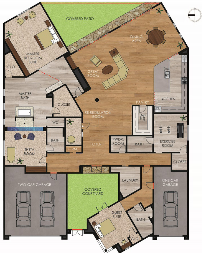
Figure 1 Residential floor plan (NTS) (Image by authors)

thus allow for morning sunlight to penetrate the room and help the person wake up by facilitating the reuptake of melatonin (see Figure 1). This placement would concurrently allow the room to be darker and cooler during the mid and late afternoon when the sun moves westward, and when headaches are more likely to present.