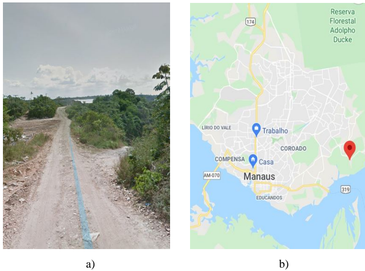
Fig. 4. Clandestine disposal in the city Manaus. a) Second site of the illegal disposal; b) Located at geographic coordinates 03°06'15.0"S and 59°54'52.5"W

The geographic location of the second clandestine disposal site is close to the first one, having the geographic coordinates 03°06'15.0"S and 59°54'52.5"W, as shown in Fig. 4. The area of this second illegal disposal site is 5 times larger than the area of the first site, which aggravates the environmental impact caused in the soil and groundwater.