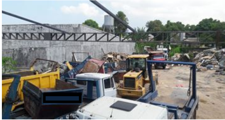
Fig. 6. Private companies that exploit the collection of CDW without adequate supervision

These clandestine disposal sites must be eliminated as they are a danger to the environment of the Amazon, and can cause effects on the health of animals, plants and humans that are in contact with the soil and water close to these places. However, after these sites are eliminated, certainly others will be created as there is no alternative in the city of Manaus for a sustainable disposal of the CDW. In this way it was proposed to the Manaus City Hall to change the current public policy of banning the disposal of CDW in the public landfill of Manaus, so that the public landfill in the city of Manaus can receive the disposal of CDW in its area of operation, enabling the adequate inspection of the final destination of CDW. It was also proposed to install, at the public landfill in Manaus, equipment for crushing and separating CDW, to enable the recycling of materials and its subsequent donation, sale or exchange, aiming to promote the circular economy of sustainable materials originating from CDW. The Manaus City Hall must also insert tax free incentives for construction companies and ordinary citizens to discard their CDW in appropriate places that have the inspection of the environmental preservation sectors in the Amazon.