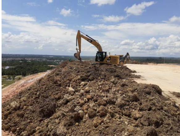
Fig. 2. Backhoe operating in the Manaus public landfill

into account that on average 35% of all waste generated in the world is CDW, depending on the diffuse nature of construction projects, the impact of contamination of these CDW in the Amazon should not be overlooked by public policies. Brazil is among the signatory countries of the Paris Agreement 2015, so it must follow the prerogatives for reducing CO 2 emissions suggested by the UN based on the scientific studies presented in the reports of the (IPCC, 2020), collaborating for the reduction of pollutants that degrade the soil and air in the Amazon.