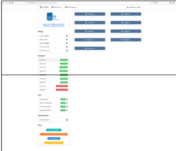
Figure 7. Main Page Display.