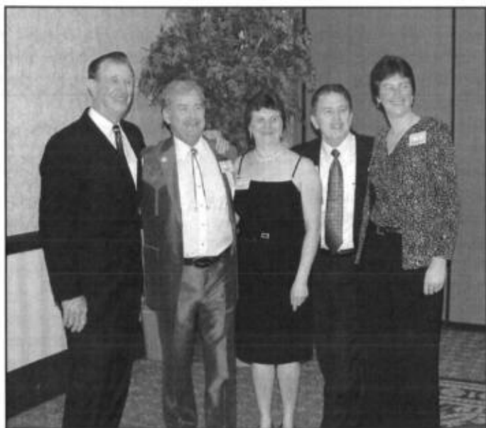
The new CALLERLAB committee... They have been assigned the task of suing all non-square dancers for not square dancing.

So, though, my calling career is ending, we have made lifetime friends through dance. This beginning is made possible only by a great ending. My last square dance is New Year's Eve in Las Vegas, and my last contra dance will be at the Lloyd Shaw Foundation's Rocky Mountain Round-up in Colorado Springs. What a way to go!