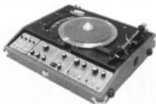
AC-205 full feature variable speed turntable and two channel amplifier. Remote volume control and record reset from microphone.