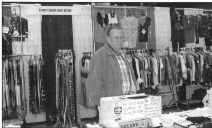
Buy a shirt and we will give you 30 seconds of a random song. Buy enough shirts and you might actually get a whole song.

Be a confident dancer! If you thoroughly understand the MS and Plus Basics, your success at Advanced will be greatly magnified.