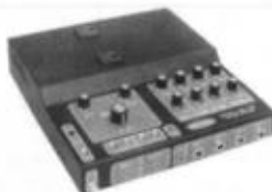
Small and lightweight MA-150 power amplifier and microphone mixer. Ideal for use with MD, CD players and laptops.

Caller's Angels V4.0 computer choreography program on CD is now available with voice recognition allowing the user to speak the calls into a microphone and watch the monitor icons execute the call. Also available is version 3.2 on CD without the voice recognition feature.