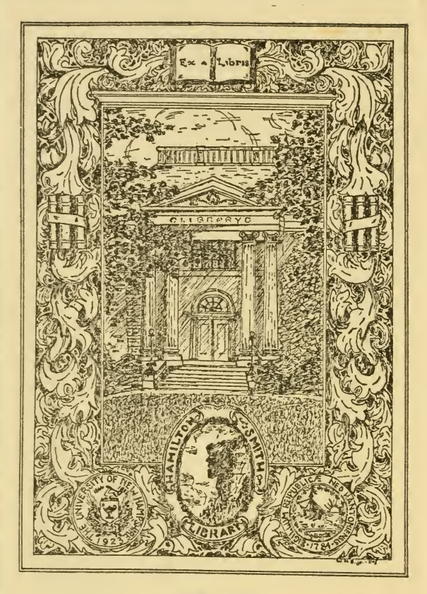
GIFT OF Fitzwilliam, N. H.