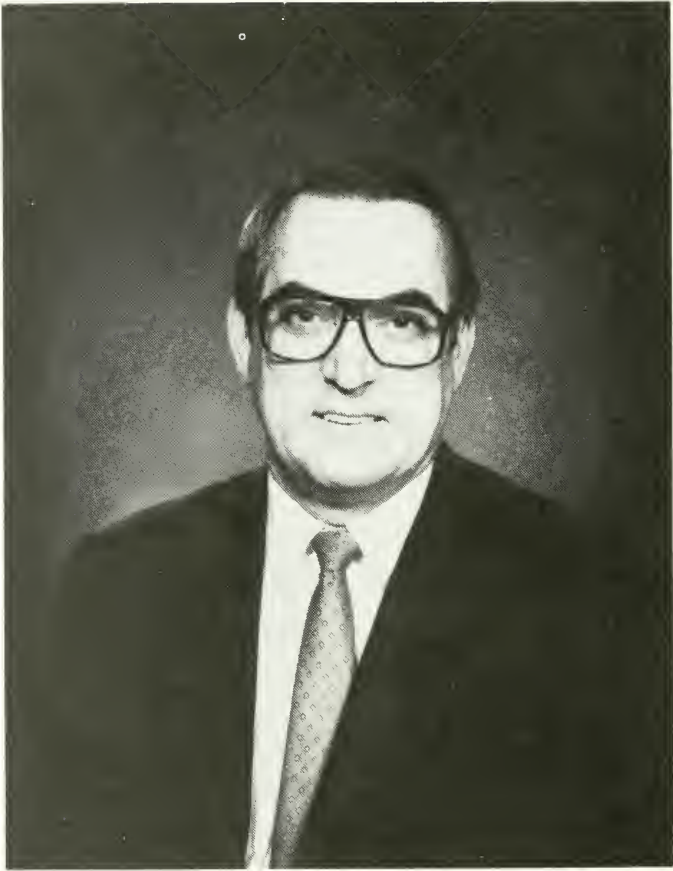
MAYOR RICHARD GREEN