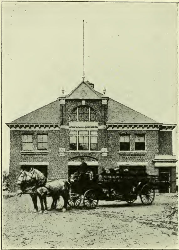
CENTRAL FIRE STATION