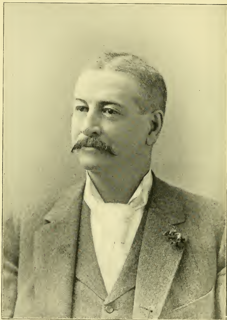
MAYOR CHARLES W. BICKFORD.