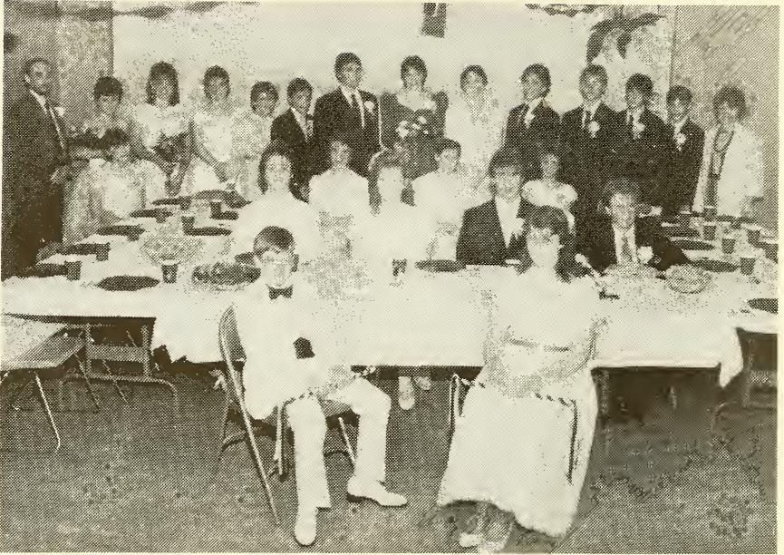
Goshen-Lempster Graduation (1987)