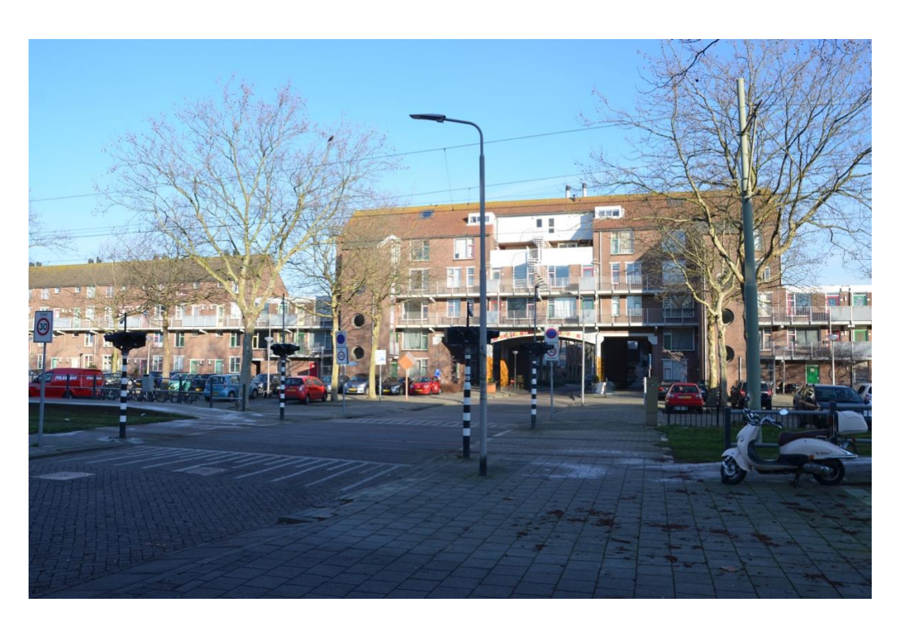
A view of a street in the Tanthof neighbourhood.

TP: Currently we are working in Tanthof on densification and the introduction of better housing options for the elderly. The banks of the Schie canal are prone to redevelopment in high density, including small scale industry and housing. And do not forget the potential of the existing neighbourhoods: we try to bring more green area and density. Also around and on the TU Delft campus: there's a growing demand to live in the academic ambience, also from people who don't study there, but just feel connected.