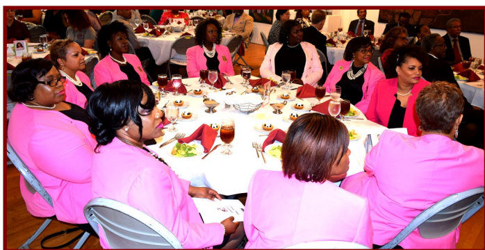
Members of the Tau Omega Chapter of the Alpha Kappa Alpha Inc. Sorority

The luncheon raised $7,000.00 benefitting the programs sponsored by the college.