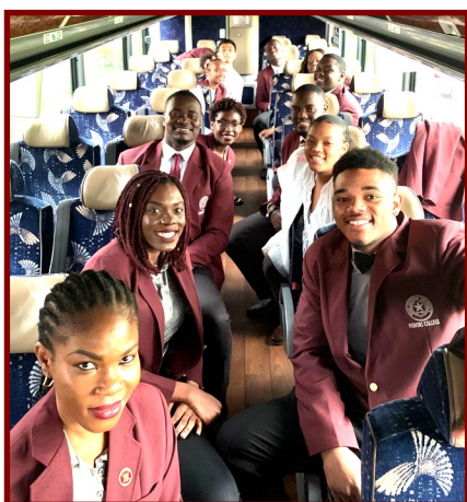
Honors Scholars on their way to Southern University, Baton Rouge