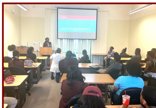
Research presentations at Southern University