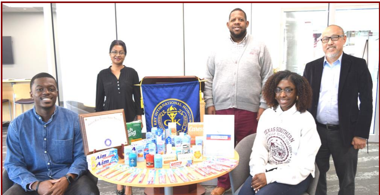
GK Community Service: Canaan Orphanage Hygiene Products Drive