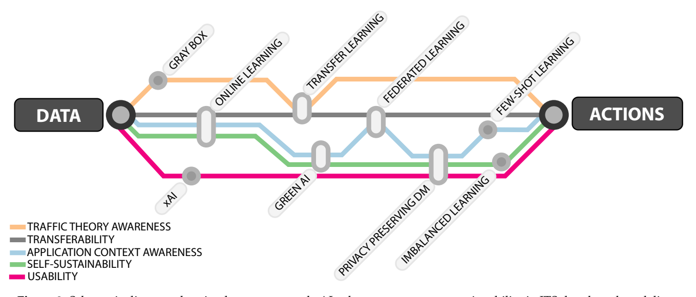
Figure 3. Schematic diagram showing how avant-garde AI subareas can promote actionability in ITS data-based modeling workflows. Subareas contributing with particular emphasis to different functional requirements are connected together along the way from data to actions.

We next discuss on the research opportunities spurred by the above research lines, their connections with the requirements presented in Section 3 (shown in Figure 3), as well as the challenges that stem from the consideration of these AI areas in the context of ITS.