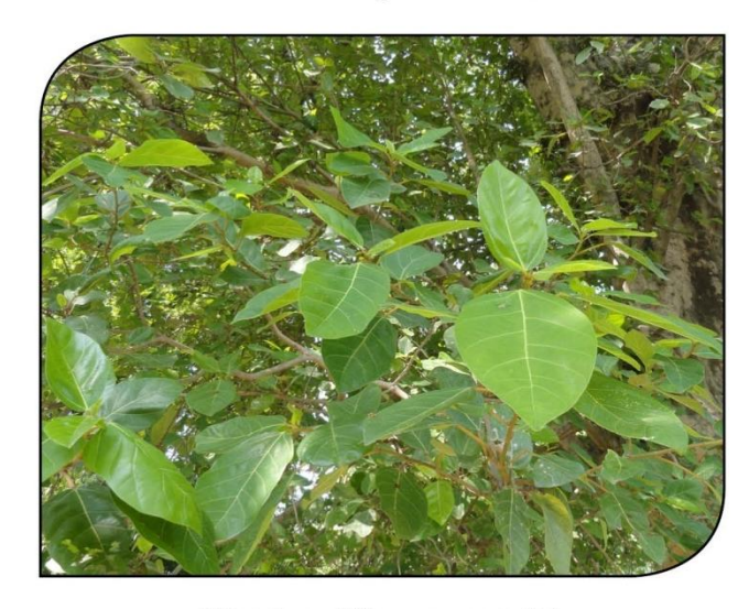
Udumbara [Ficus racemosa L.]