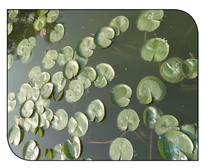
Kumuda [Nymphaea alba L.]