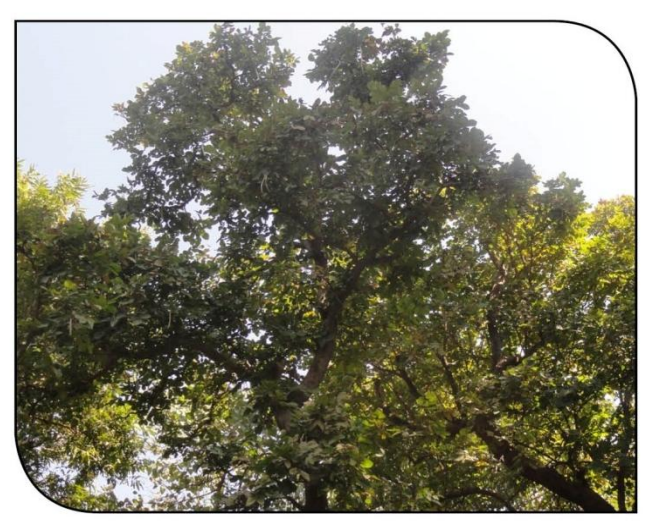
Pāṭalā [Stereospermum chelonoides (L.f.) DC.]