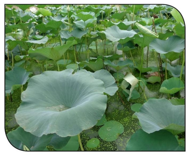
Kamala [Nelumbo nucifera Gaertn.]