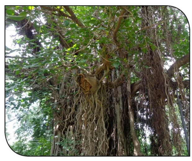
Vața [Ficus benghalensis L.]