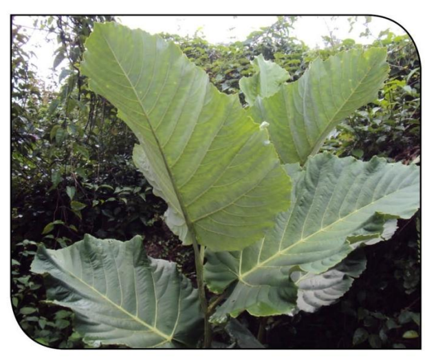
Hastikarņī [Leea macrophylla Roxb. ex Hornem.]