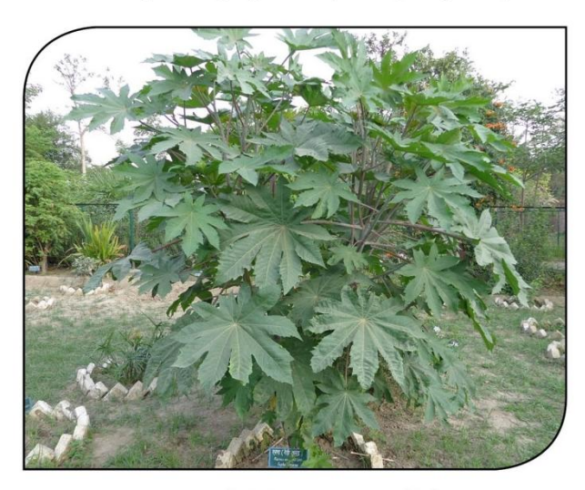
Eranda [Ricinus communis L.]