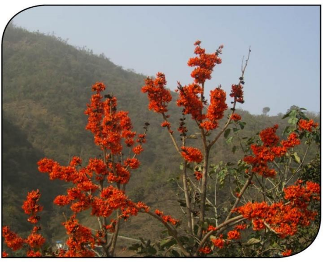
Palāśa [Butea monosperma (Lam.) Taub.]