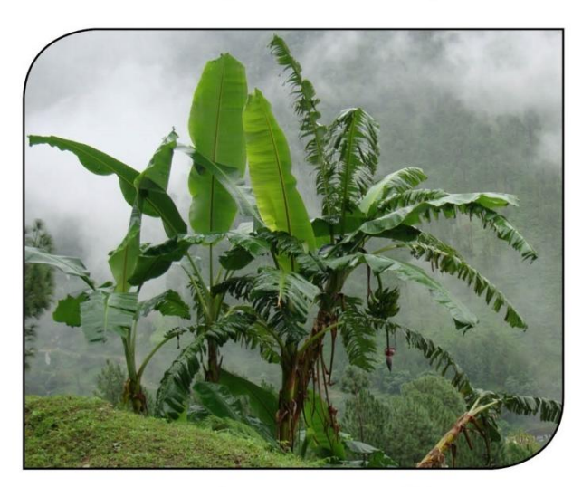
Kadalī [Musa × paradisiaca L.]