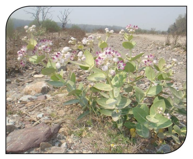
Arka [Calotropis procera (Aiton) Dryand.]