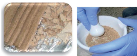
Figure 3. Sample: Thermoforming and maceration.

When an analyte cannot be determined, it must be transformed to a state in which an appropriate identification and quantification technique can be applied.