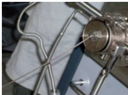
Figure 2. Film extrusion machine.

There are currently no studies reporting Cd found in thermoformed and biodegradable flexible films; however, the literature does report the presence of Cd in cassava tubers’ cortex [42], cassava food crops [51], as well as Cd contaminated rice which causes the Itai-itai disease [52] by exposure to Cd-contaminated water