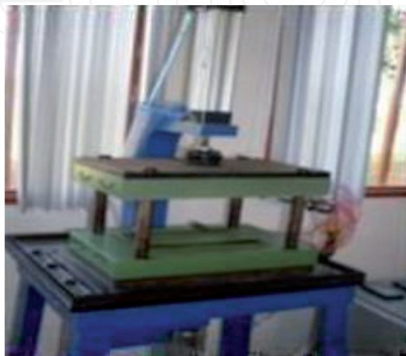
Figure 1. Compression molding machine used for thermoforming.

Industries are currently striving to improve their products by using natural and renewable sources to store, package, and wrap food products [7, 8, 29, 32, 36]. These include thermoformed and flexible films (biopolymers) obtained from agricultural sources (cassava), and constitute a new and environmentally friendly industrial alternative (composting) given their rapid and easy biodegrading processes. Their main purpose is the replacement of regularly used petroleum-derived plastic polymers and their associated waste [8, 18, 20, 22, 23, 26, 31, 37, 38]. A common production method for thermoforming is the compression molding technique ( Figure 1 ), in which the material is placed into an open mold to which pressure and heat are applied.