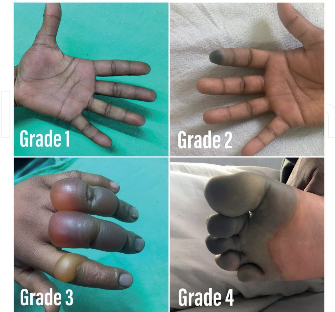
Figure 2. Grades of frostbite.