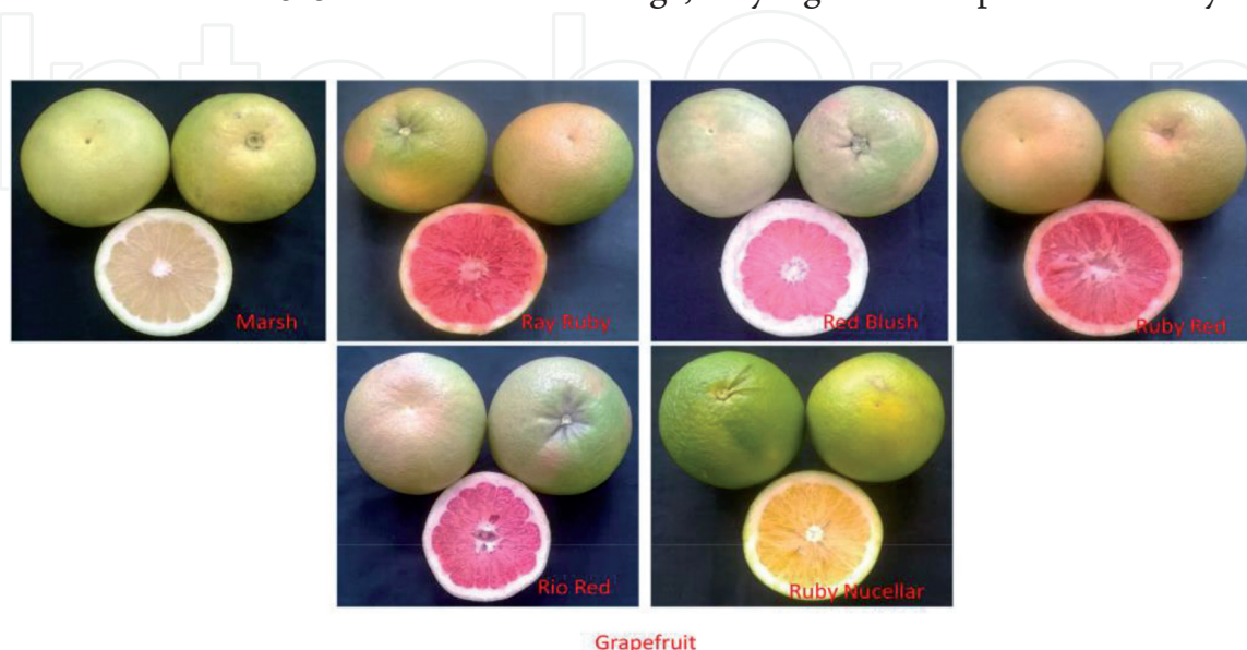
Figure 3. Grapefruit varieties.

Duncan: It was developed as chance seedling in Florida. It is the hardiest variety for cold, fruit color yellow, surface smooth, shape oblate to globose, size large, basal area depressed, apex round, rind medium thick, firm, axis medium in size segments 12–14 and 25–50 seeds. Plants are large, very vigorous and productive early