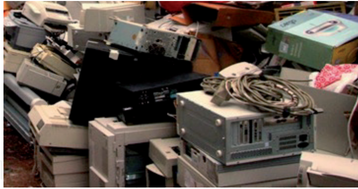
Figure 1. Computer-based e-wastes for sale in Ikeja Lagos Nigeria.