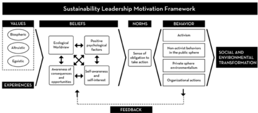
Figure 3: A Framework for Understanding the Motivation of Sustainability Leaders

The resulting framework as such draws on elements seen in the Value-Belief-Norm Theory (see Figure 1) and theoretical approach to authentic leadership.