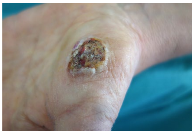
Figure 1 - Cutaneous squamous cell carcinoma on the hand of a renal transplant recipient.

The most contributing factor is ultraviolet (UV) radiation, explaining why the majority of CSCC occur in sun-exposed