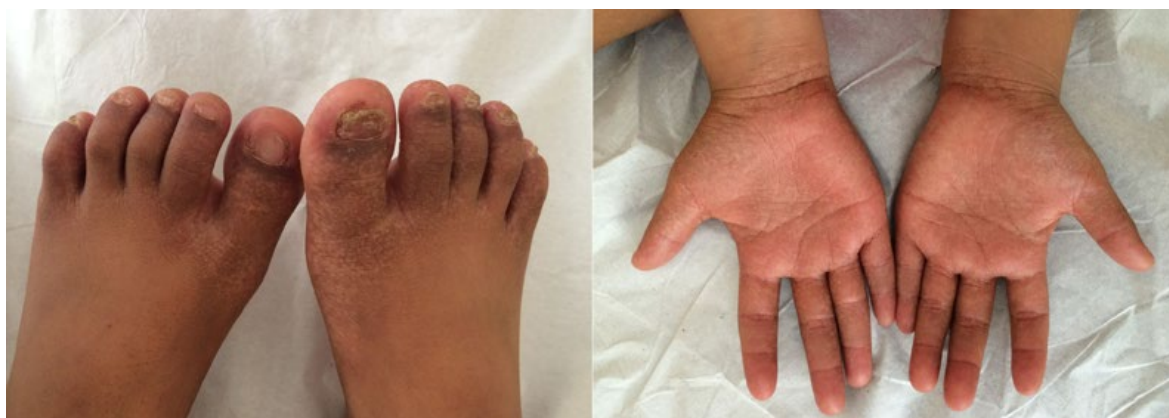
Figure 1 - Hands and feet showing bilateral reticulated hyperpigmentation. Onychodystrophy is evident in the feet, being more severe in the right foot. Bilateral adermatoglyphia is also evident on the hands.