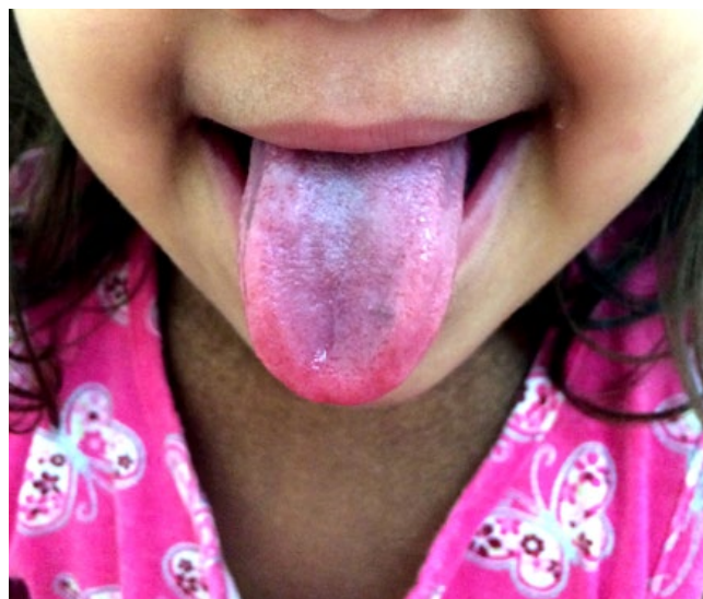
Figure 3 - Oral leukoplakia on the papillary surface of the tongue measuring approximately 2 x 1.5 cm.

DC was first described in 1906 by Zinsser, and then characterized as a clinical entity in 1926 by Engman and Cole,