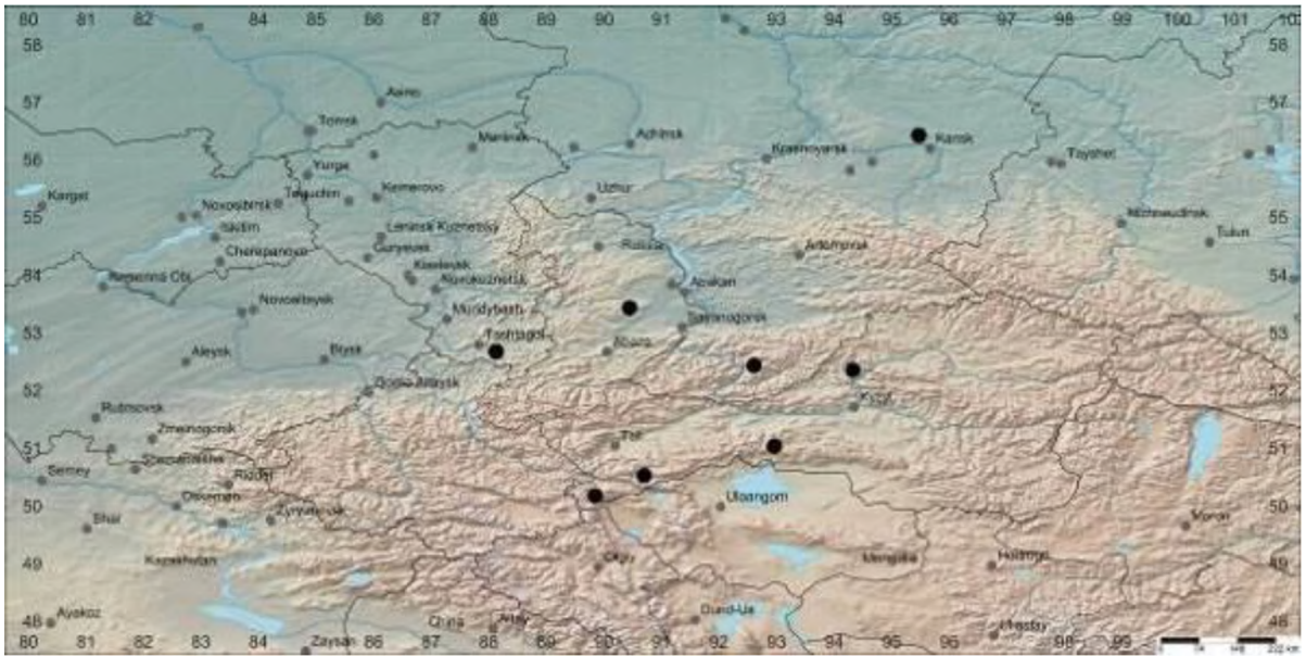
FIGURE 1. Distribution map of Trollius austrosibiricus .