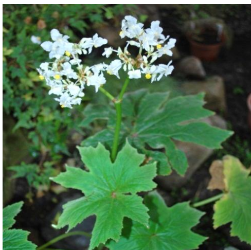
Figure 1. Ludwig Begonia ( Begonia ludwigii ).

E.K. Gray and later, in 1937, described by Edgar Irmscher [2]. B. ludwigii (figure 1) is endemic to the Republic of Ecuador, where only 4 populations of this species are known and the expansion of farmland is the main limiting factor leading to a reduction in natural habitats. B. ludwigii is listed by the International Union for Conservation of Nature in the list of endangered species and has the conservation status EN (endangered species) [3].