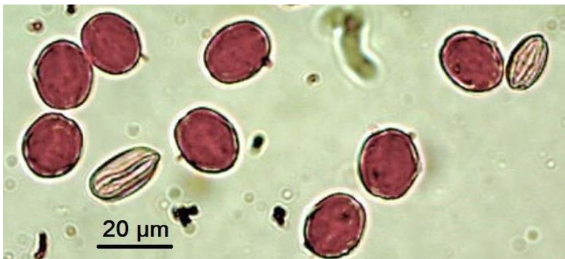
Figure 3. Fertile (burgundy) and sterile (colourless) pollen grains of Begonia ludwigii .

The study of the male reproductive sphere showed that in the green house conditions of SibBS TSU B. ludwigii has a high fertility and pollen viability - 96.4 and 87.3%, respectively. The length of pollen grains is 18.3 \pm 0.2 \mu\text{m} , and the width is 12.3 \pm 0.1 \mu\text{m} (figure 3).