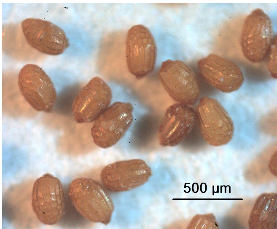
Figure 4. Begonia ludwigii seeds.

germination begins 3-4 weeks after sowing. Laboratory germination of seeds is high - 92.8%. Twin seeds with a common testa were encountered singly, probably resulting from the abnormal development of integuments even at the stage of ovule formation.