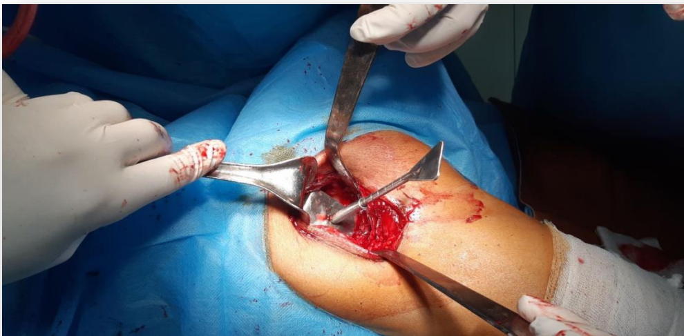
Photo 1. Device for determining the landing depth of the acetabular component of the hip joint endoprosthesis during surgery