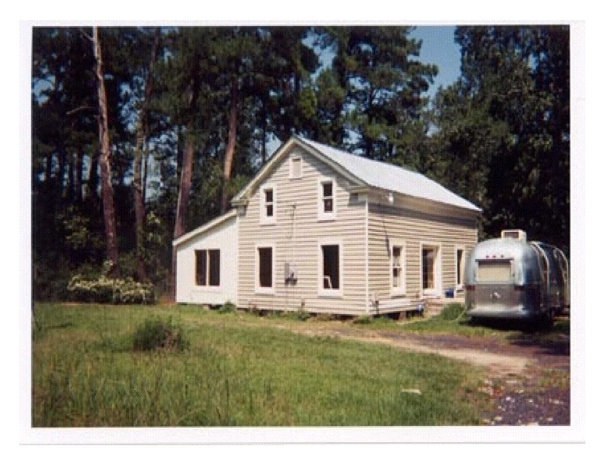
Comments: "A good example of a private home that fits the character of the road."

<u>"Property Rights" Theme</u>: A total of 27 references to the "Property" theme were reported by the REP participants, and are interpreted as representing nine sub-themes. The "Property" theme had an overall importance rating of 6.26 on a 7-point scale. An example of photographs and comments addressing the "Property" theme is presented below: