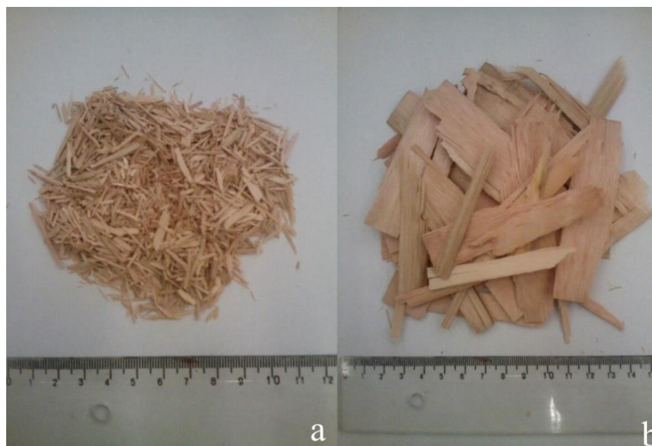
Figure 2. Eucalyptus badjensis particles. a) slivers b) strands Figura 2. Partículas de Eucalyptus badjensis . a) slivers b) strands

At the study facility, the boards were cut into pieces of approximately 90 mm wide and 150 mm long and then turned into strands that were sieved through a 9.52-millimeter sieve to remove smaller particles. In a hammer mill, part of the strand-type particles (Figure 2b) was turned into sliver-type particles (Figure 2a). Subsequently, this material was sieved for the removal of fine particles, using 8- and 30-mesh sieves, with 2.36- and 0.6-millimeter openings, respectively. The average length of the Eucalyptus badjensis particles was of 10.50 mm for slivers and 78.29 mm for strand particles.