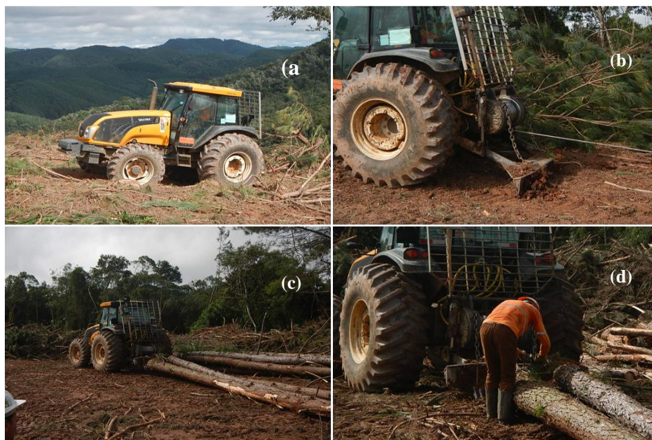
Figure 1. Extraction operation performed by farm tractor with winch: (a) farm tractor at embankment border performing extraction; (b) winch details; (c) logs being skidding; and (d) forest worker unhooking logs.

Figure 1 presents some aspects of the winching operations. It is possible to verify in Figure 1.a the general aspect of the region with mountainous topography, while the 1.b, 1.c and 1.d show winch details, timber skidding and unhooking logs.