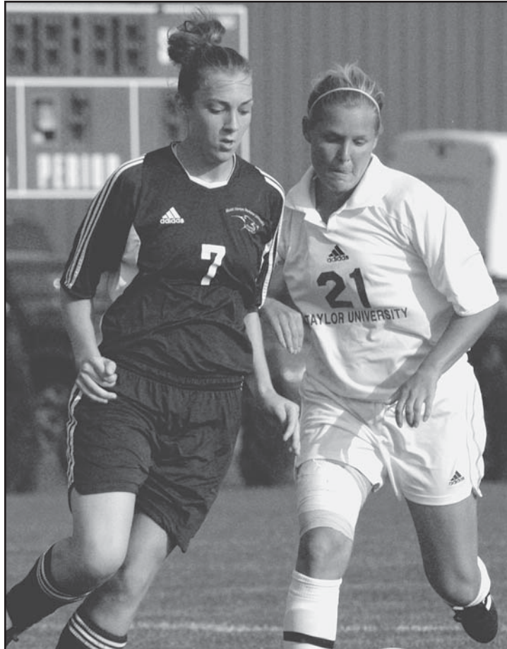
Vernon defender during Monday's match. It was the Trojans first home game this

The Lady Trojans travel to Cedarville University Friday