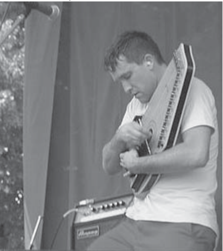
Xiu Xiu's Jamie Stewart rocks out on the autoharp.

virtues of wild eclecticism, its under $30 price tag and the communal spirit of the event. The festival shunned $3 water bottles and ubiquitous advertising by its sponsors for reasonably-priced refreshments, a free water station and a tent featuring homemade clothing and crafts by local artists, as well as an impressive record fair hosted by radio station WLUW. The most telling example of Intonation's diverse appeal came as the large crowd that had gathered to hear hip-hop artist Prefuse 73 stayed up close for hard rockers DFA 1979.