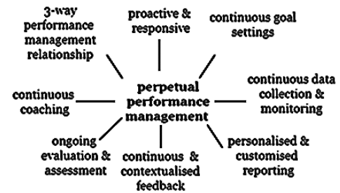
Figure 2: Characteristics of PPM

This is a significant shift from the traditional PM approach, where managers share and discuss employee performance on an ad-hoc basis. Based on the description above and the characteristics in Figure 2, we propose a new term “ perpetual performance management ” and define it as an emergent PM approach that is proactive, responsive and involves continuous monitoring, continuous data collection, contextualised and constant feedback, customised goal settings, and granular, personalised and customised reporting, and shorter performance cycles . The implications of PPM are discussed next.