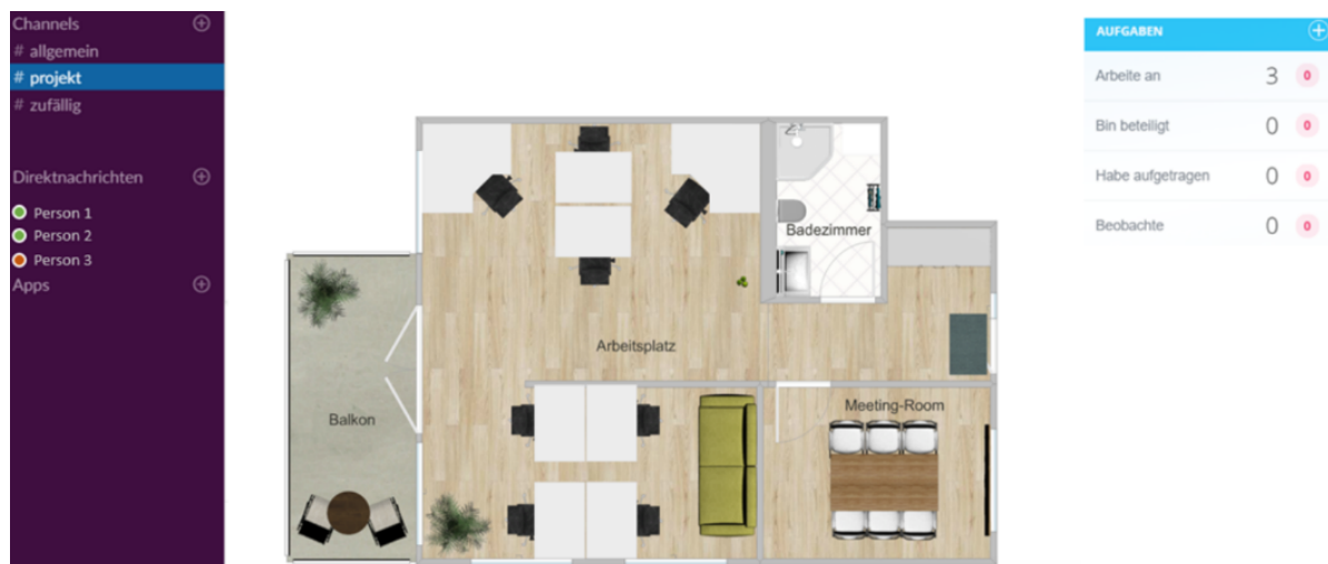
Figure 2: Mock-up of a platform that could support people in coworking spaces which was shown in the interviews.

We identified the participants through internet research and existing contacts (peers, colleagues and project partners) and conducted the interviews between May and June in 2019. The duration of the interviews varied between 40 and 70 minutes with an average duration of 49 minutes. As there are different groups of people working in coworking spaces such as employees, students, entrepreneurs and freelancers (Weijts-Perrée et al. 2019), we interviewed people representing one or several of these groups (Table 1.).